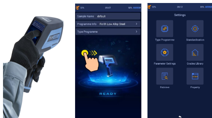
Figure 2: Illustrating (on the left) Changing the settings with 1 swipe.

The universal curve function makes it easy to just pick up and start testing straight away.