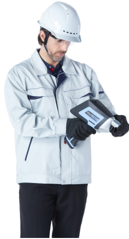
Figure 4: Illustrating appropriate safety goggles being worn during testing

Its portability and weight at approximately 2kg, makes it easy to use in any situation and environment.