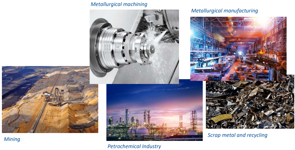
Figure 1: Examples of where the CALIBUS has been used.

The new CALIBUS is an ideal analytical solution for QA/QC, metallurgical manufacturing and machining, petrochemical industries, mining, scrap metal and recycling (figure 1).