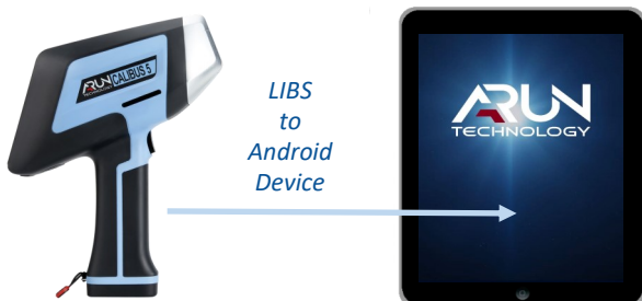
Figure 7: Data transfer between LIBS and Android device

The smart phone and tablet interactive interface makes the CALIBUS more convenient to use. It has a 5-inch colour, high resolution touch screen that is protected with a super impact-resistant glass material.