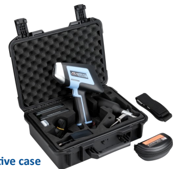
Figure 6: Portable protective case