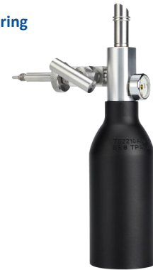
Figure 5: Argon gas cylinder

One argon canister can perform to carry out 300 excitations. A portable gas cylinder comes with the CALIBUS instrument (figure 5). It is used for topping up the argon canister (up to 15 times). This means an amazing 4,500 tests can be continuously performed on site.